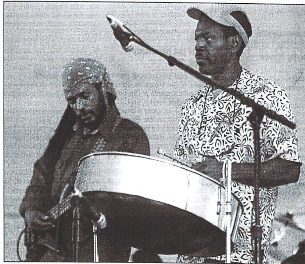
Members of The Heavy Weights entertained the guests attending the Island Creek Oyster Festival with some reggae.